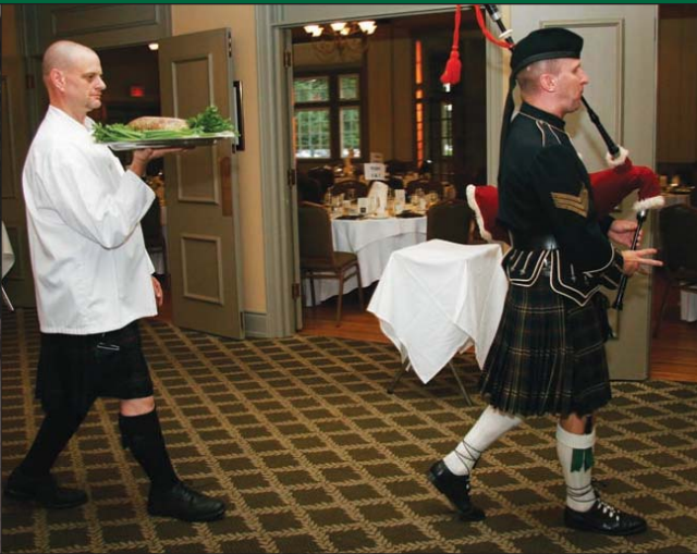
They continue their march into the dining room.