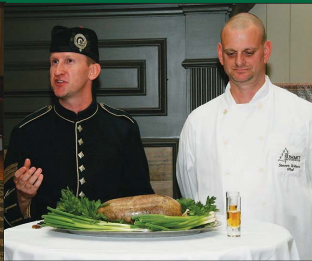
The piper begins an intonation to the haggis - Scottish theatre at its best.