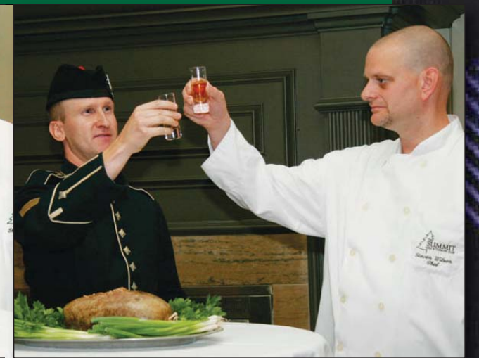
Then the two Scots, with a toast, pronounce the ceremony over.