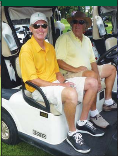
Ready to compete in the Hi/Lo competition.