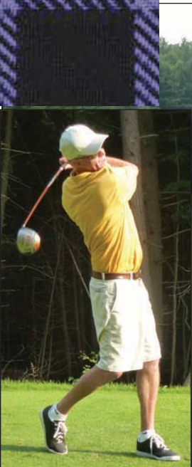
Summit's natural topography was put to good use by Stanley Thompson, making it one of the province's finest golf courses.