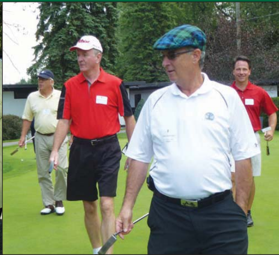
From the putting green to the cart staging area.